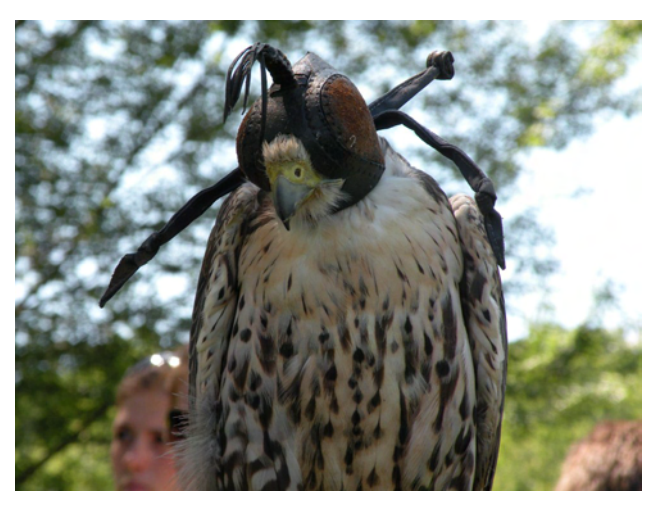
The Lamber Falcon, at rest

Chris Ketola, from the centre, brought a Great Horned Owl, an Eurasian Eagle Owl and a Lamber Falcon to the park and spent the day telling children and adults about these fascinating birds. Folks had a chance to see the birds up close, talk to him about them, and to learn about the birds' lives and habitats and their role in the ecosystem.