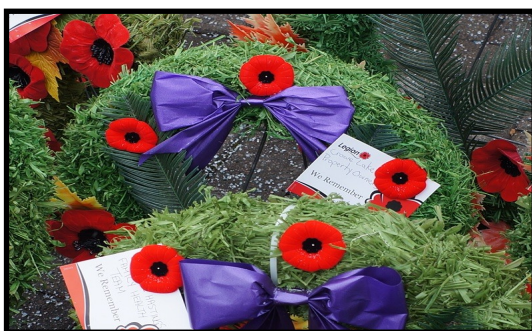
Remembrance Day Wreath laid at memorial in Marmora Park, November 2019 from CLWA

Crowe Lake Waterway Association, P.O. Box 192, Marmora, Ontario K0K 2M0 www.clwa.ca