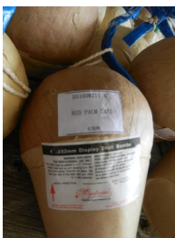
That's what a firework display shell bomb looks like

August: Exec Board meeting critique of the fireworks weekend, thank donors, start thinking about 2014.