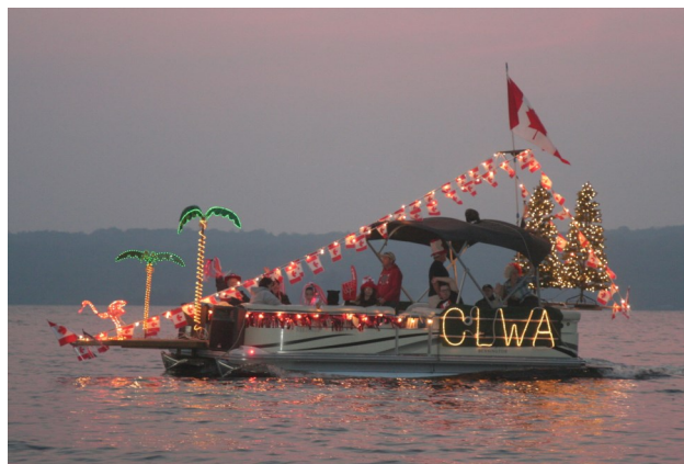
The World Famous Boat Parade... Just before the Fireworks

The list of Officers and Executive Board is shown above.