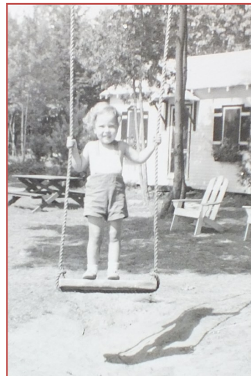
This old photo is of me, aged 3 ½, at Glen Allan Park, proud of mastering the large swing which could hold 2 adults.

Consider copying your black and white photos in colour for better resolution.