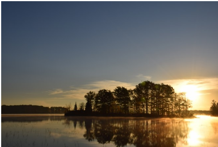
Honourable Mention Tequila Sunrise Tim Black