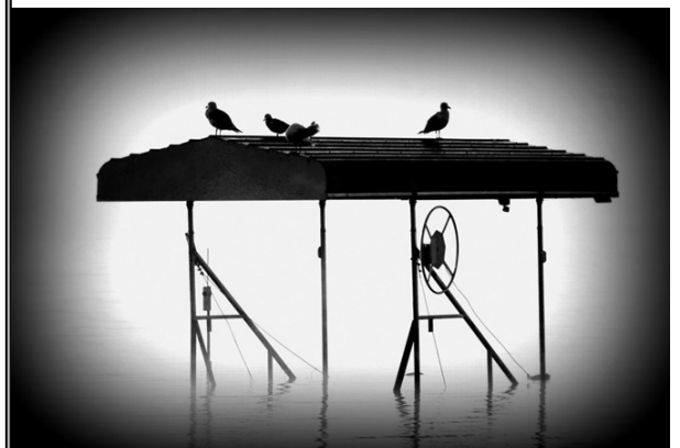
Honourable Mention Seagulls on the Boat Lift Tim Black