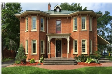
Parkin Professional Building