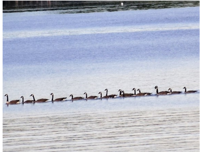
Third Prize Geese Parading For Canada 150 Herb Welsh