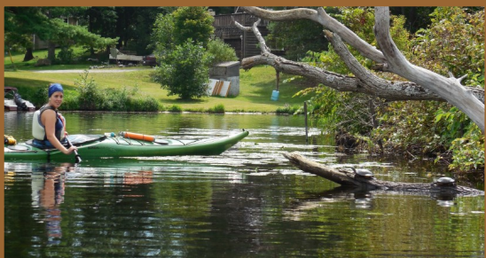
Enjoyment - Wade Gapes