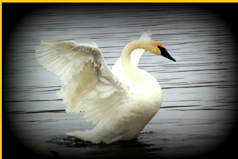
Crowe River Swan - Tim Black