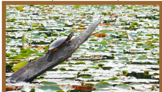
Just Relaxing in the Sun - Wade Gapes