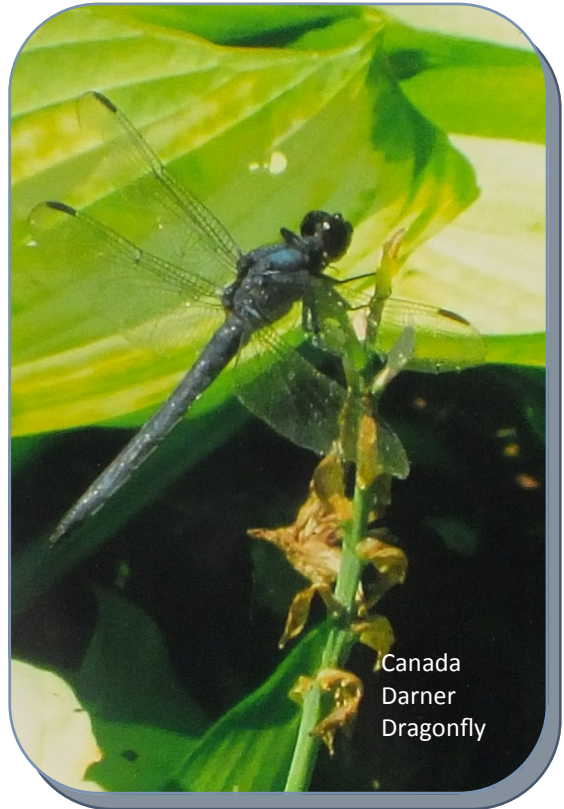
Canada Darner Dragonfly