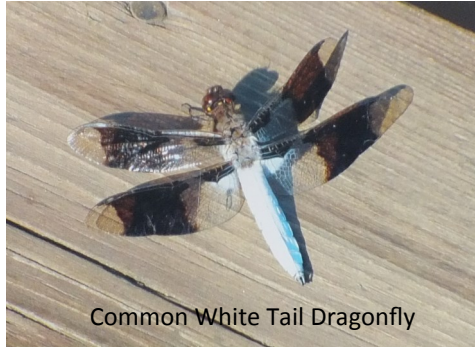
Common White Tail Dragonfly

Bug science has its own jargon. Basically an insect has 3 parts, a head, a thorax and an abdomen.