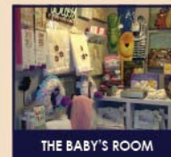
THE BABY'S ROOM