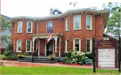
Parkin Professional Building

Direct: 613-922-6180 marmorarl@outlook.com